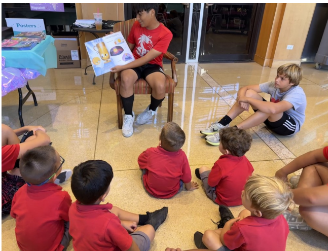
Middle Schoolers read to our younger students during the Book Fair.